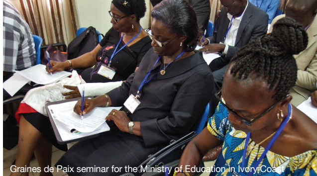
Graines de Paix seminar for the Ministry of Education in Ivory Coast

These include a dictionary of key peace and education terms, peace and non-violence concepts, quotations and proverbs classified by school thematic, peace tales and sketches, cooperative games, plus fun and humour.